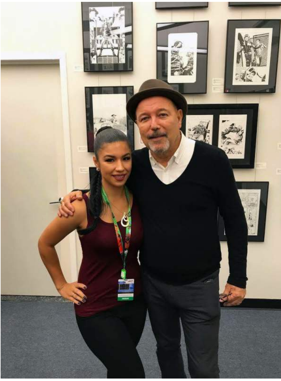
RUBEN BLADE AT METROPOLIS COLLECTIBLES

Thanks to <u>Metropolis Collectibles</u> for connecting me with Rubén! Metropolis is the first call celebrities and serious collectors make when building their comic collections.